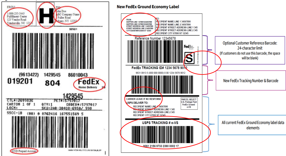
Diagram G – Belk Ship Label Sample