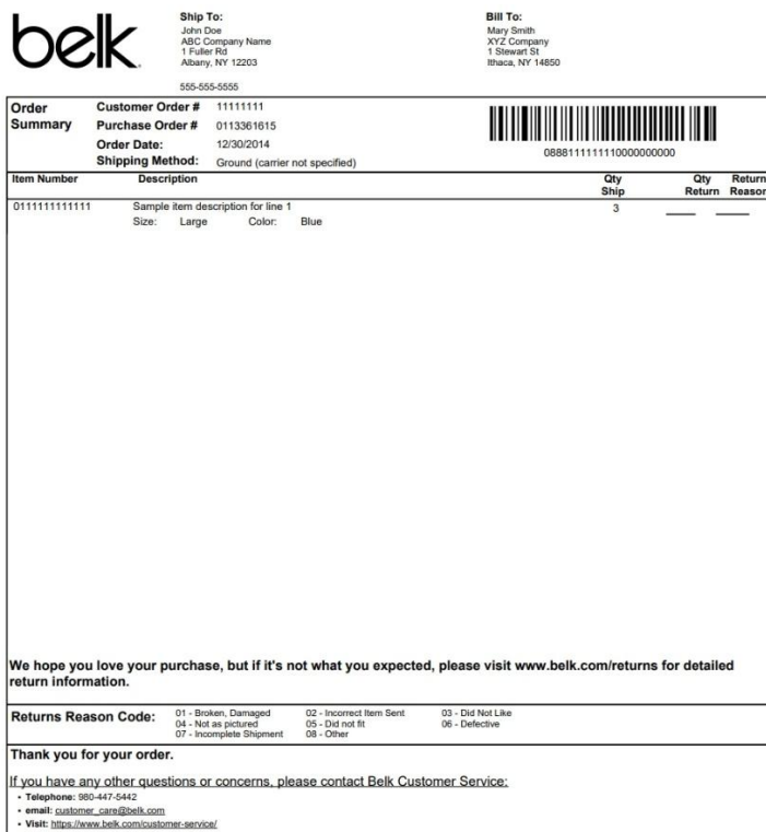
Diagram F – Belk Branded Packing List

Return label section on this packing slip will be left blank if Belk takes the returns directly from the customer. If the vendor accepts direct returns from the customer, it will be populated with the vendor’s return address, as shown above.