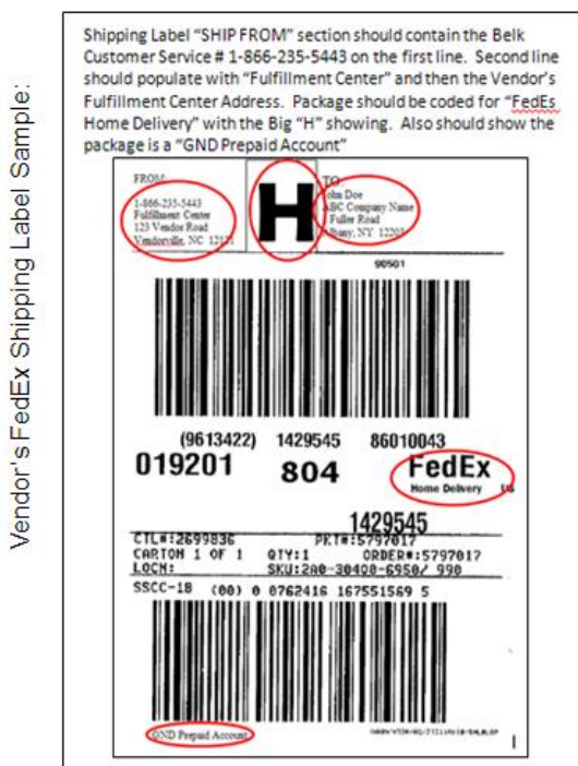
Diagram G – Belk Ship Label Sample